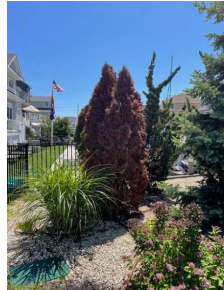
Dead Trees will be removed and replaced where appropriate

All irrigation systems experience the need for repairs each season. Preliminary inspections of each location have been completed, and some areas need minor repairs to make the system fully operational. All common area irrigation are expected to be operational by mid-June. We ask all members to keep an eye out for areas on common property that may appear to be extremely wet when they typically shouldn't be - this may be the result of a faulty water valve or irrigation system component.